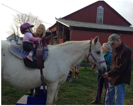
Above: Pumpkin - trusted with even the smallest of riders.