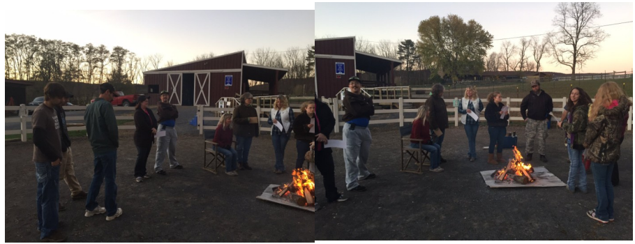
Above two photos: The group of people gathered in the round pen to remember Pumpkin and share stories from her life.