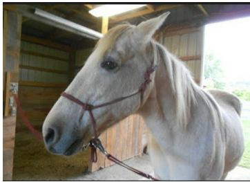
Above: “The picture was taken the second time I was at Horses of Hope and got to work with Pumpkin.”

“Everyone loved Pumpkin. She served a great life. She passed away peacefully and is buried in a beautiful place.”