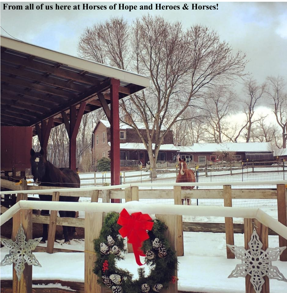
"Star and Fancy say Merry Christmas!"

From all of us here at Horses of Hope and Heroes & Horses!