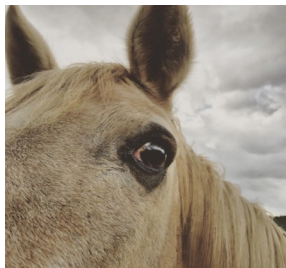
Above: “Loved by all of our volunteers and riders, these horses are truly amazing... especially Pumpkin.”